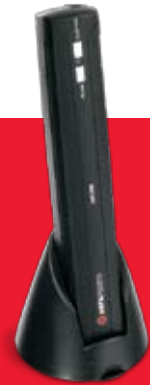
AS 1300 AS 1300 Pro Photo & Document scanners

Sagem Communications introduces its exciting new range of AgfaPhoto scanners. The new AgfaPhoto scanner range, in four models, is a revolution in digitization. With these new easy to carry products, you can now save and share photos and documents in just a few seconds.