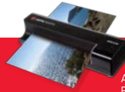
AS 1110 Photo scanner